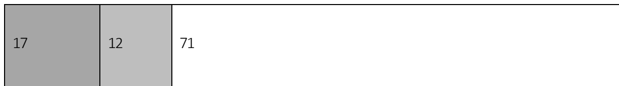
Figure 1. Loss of Prospective Teachers Because of Praxis Scores

What’s the combined impact of Praxis Core and Praxis Subject Assessments on the initial pool of prospective teachers? The answer to this question is shown graphically in Figure 1. To understand these graphs, consider a sample of 100 white students and a sample of 100 African-American prospective teachers. Of the 100 white students 17 would be lost based on their Praxis Core scores. Another 12 would be lost based on their Praxis Subject Assessment scores. A total of 29 white students would be eliminated, leaving 71 white students remaining in the prospective teacher pool. Of the 100 African-American test takers, on the other hand, 54 would be lost based on their Praxis Core scores. Another 14 would be lost based on their Praxis Subject scores. A total of 68 African-American test takers would be eliminated, with 32 prospective teachers remaining.