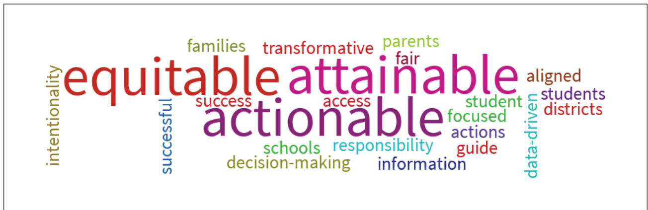
Figure 2: Key words that the AAC associated with the accountability system

When asked about key words that committee members felt should be associated with the goals of the South Carolina accountability system, the most prominent ones were equitable, attainable, and actionable (see Figure 2).